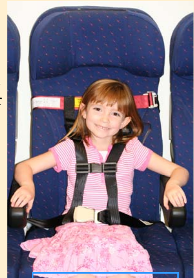
CARES child restraint

Currently, children with special health care needs can travel on airlines in their Federal Aviation Administration (FAA) approved car seat, a CARES restraint, or the Columbia 2000 Therapedic Integrated Positioning System. The CARES restraint can accommodate children from 22-44 pounds. For more information, visit www.kidsflysafe.com . The Columbia 2000 can accommodate children from 20-102 pounds. For more information, visit www.columbiamedical.com . AMSAFE has developed two child restraints which are awaiting FAA approval.