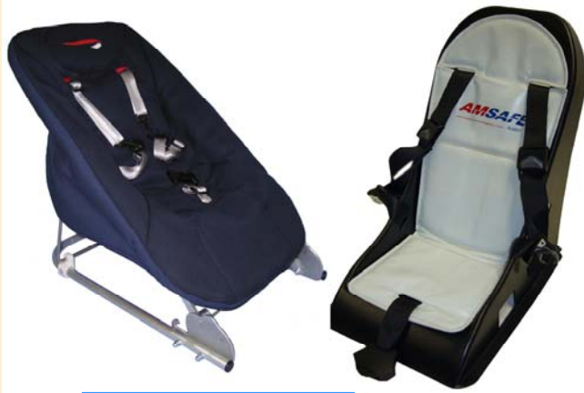
AMSAFE child restraints

The National Center for Safe Transportation of Children with Special Health Care Needs presented an informative talk on airlines, car seats and kids at the Indiana Injury Prevention Conference. Attendees learned about the use of child restraints on aircrafts, challenges, what parents need to know and the future of child restraints for aviation.