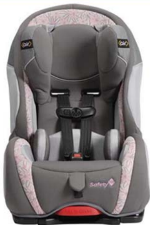
Safety 1 st Complete Air LX