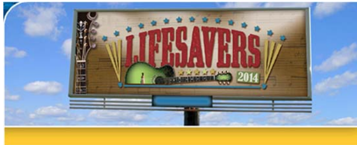
Lifesavers Conference, Inc.

Safe Kids is looking for workshop session ideas for the 2014 Lifesavers Conference in Nashville, TN from April 27-29. The Occupant Protection for Children track is in need of ideas for new research, emerging and hot topic issues. To submit your workshop ideas or possible speaker suggestions, contact Lorrie Walker at lwalker@safekids.org .