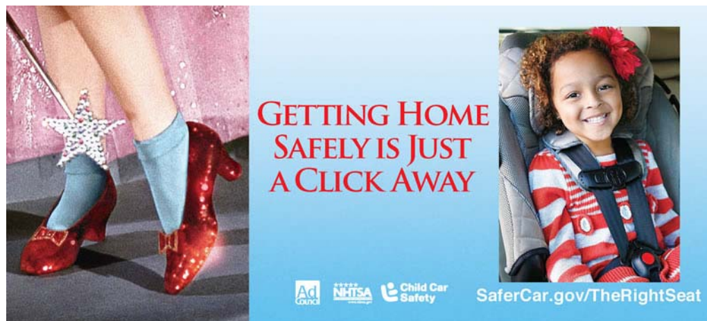
Traffic Safety Marketing

http://www.trafficsafetymarketing.gov/CAMPAIGNS/Child+Safety/Wizard+of+Oz+Child+Safety+PSAs .