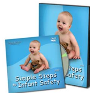
Living Legacy Productions, Inc.

http://www.livinglegacyweb.com/safety/products/infantdvd.htm .