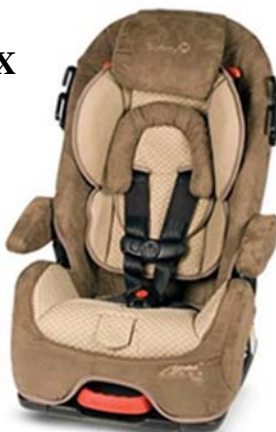
Safety 1 st Alpha Omega Elite