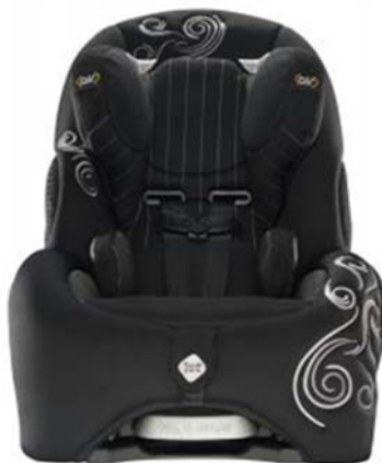
Safety 1st Complete Air SE