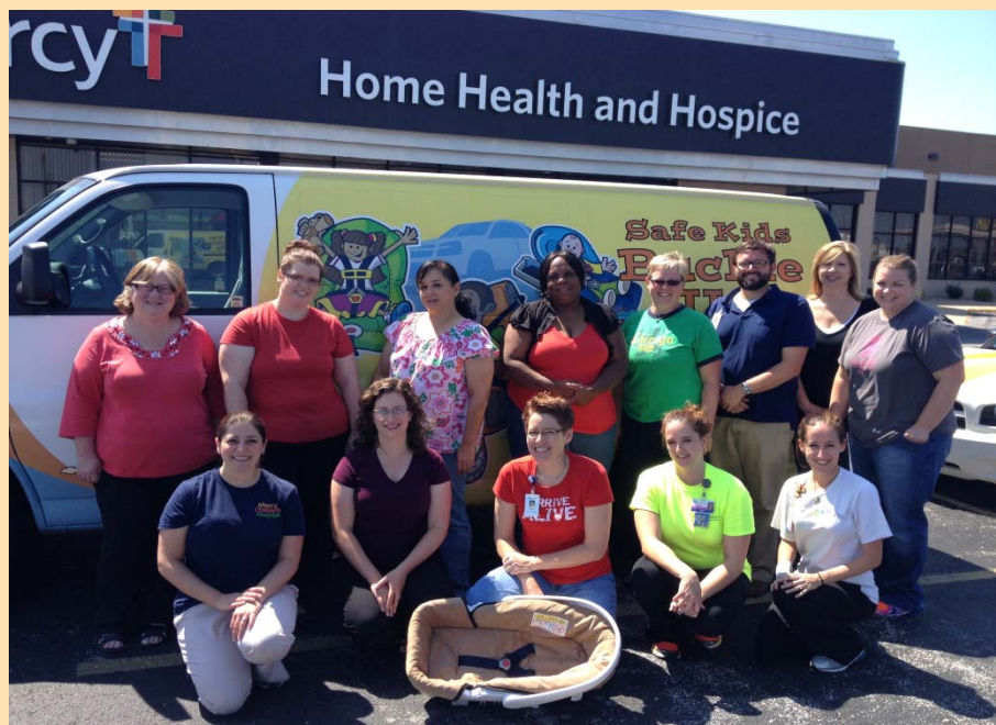
“Safe Travel for All Children” Class Participants and Instructors: Springfield, MO

Staff from the National Center for the Safe Transportation of Children with Special Healthcare Needs traveled to Springfield, Missouri on September 5-6, 2013 to teach “Safe Travel for All Children”. Eleven technicians learned best practice recommendations regarding the safe transportation of children with special needs. They also learned about the most updated specialized products available on the market.