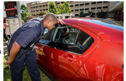
Images above and below: Heatstroke Press Conference at Gaylord Resort on National Heatstroke Day, July 31st

Safe Kids Worldwide holds their conference every other year, making the next conference in Summer 2017. A limited number of travel scholarships are offered. You are encouraged to mark your calendars to attend the 2017 Safe Kids Worldwide conference!