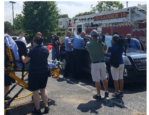
*Photo from mock rescue June 2016.